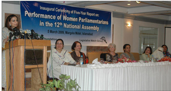
Ms Sherry Rehman, Federal Minister for Information, addressing at the launching ceremony of the report on Performance of Women Parliamentarians at Islamabad.

In order to critically see women parliamentarians' performance in the 12th National Assembly (2002-07), and document and highlight their achievements, Aurat Foundation did a detailed study, titled "Five Year Report on: - Performance of Women Parliamentarians in the 12th National Assembly (2002-2007)", in 2008. The study was first inaugurated by Ms Sherry Rehman, former Minister for Information, on 5 March 2009 at Islamabad, and followed by regional launch at all the four provincial headquarters. The study not only attracted the parliamentarians, concerned civil society but equally inspired the print media where eminent journalists wrote their analysis and opinion on the study. At Peshawar, Provincial Minister for Social Welfare, Ms Sitara Ayaz inaugurated the Five Year Report on 26