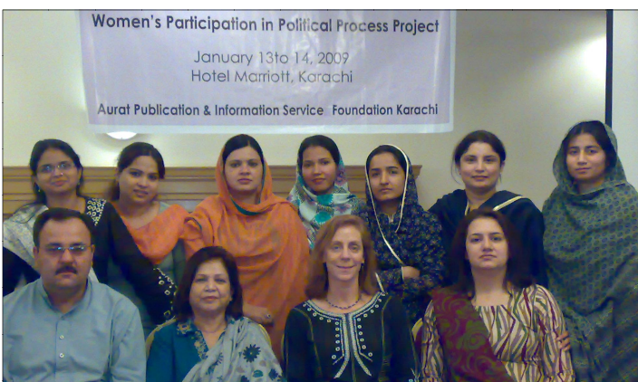
The participants of a two-day training workshop on 'Women Participation in Political Process', organised by Aurat Foundation, in collaboration with The Asia Foundation in Karachi on 13 January 2009.